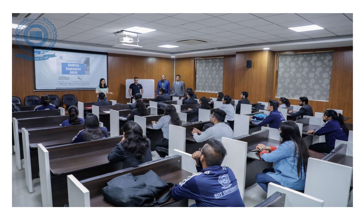
Puma Campus Placement Drive