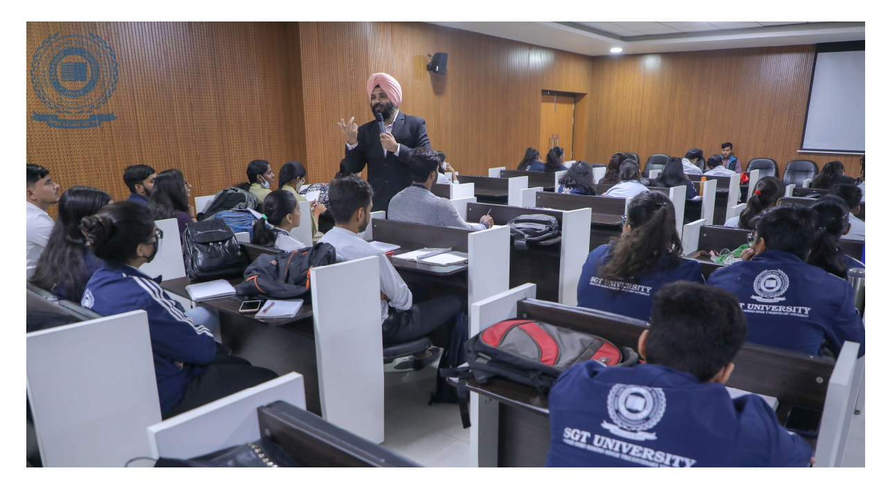
Barclay Soft skill Training Session