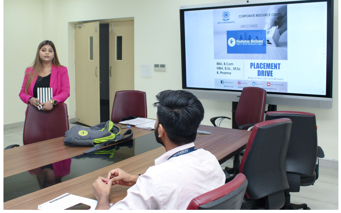
Hindustan wellness Campus Placement Drive