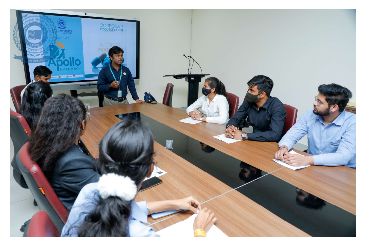
Apollo Pharmaceuticals Campus Placement Drive