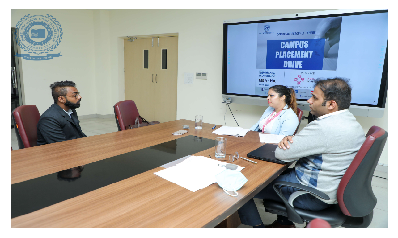
CK Birla Hospital Campus Placement Drive